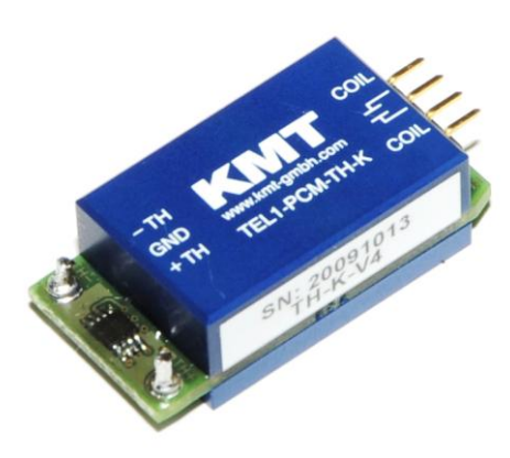
with solder pins for thermocouple

Analog signal bandwidth: 0 - 10 Hz (-3 dB) Accuracy: +/-0.5 % (without sensor) Operating temperature: - 10 to + 80 °C