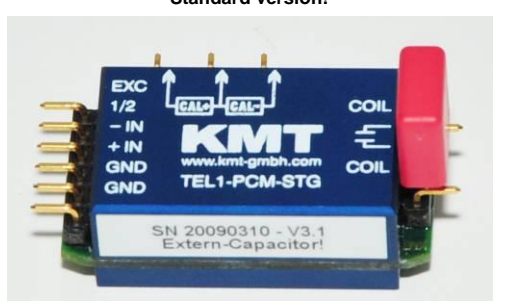
Without built-in capacitor. Only with external capacitor! E. g. 100nF for larger shaft >400mm! Specify at order!

With built-in 220nF capacitor for shaft up to 400mm recommend!