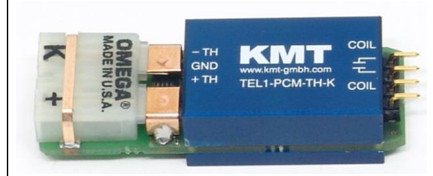
with female K type thermocouple connector