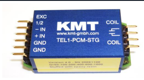
New version 4.0 without external CAL pins

With built-in 220nF capacitor for shaft up to 400mm recommend!