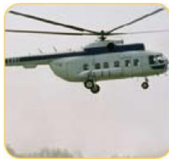
Airborne Antenna Control

The AHRS510CA meets all standard avionics performance requirements as a stand-alone system. For applications with more demanding performance requirements, the AHRS510CA provides the interfaces necessary to accept external velocity-aiding.