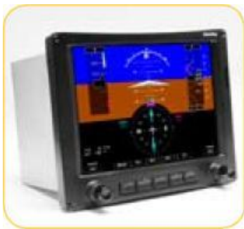
EFIS and Flight Management Systems