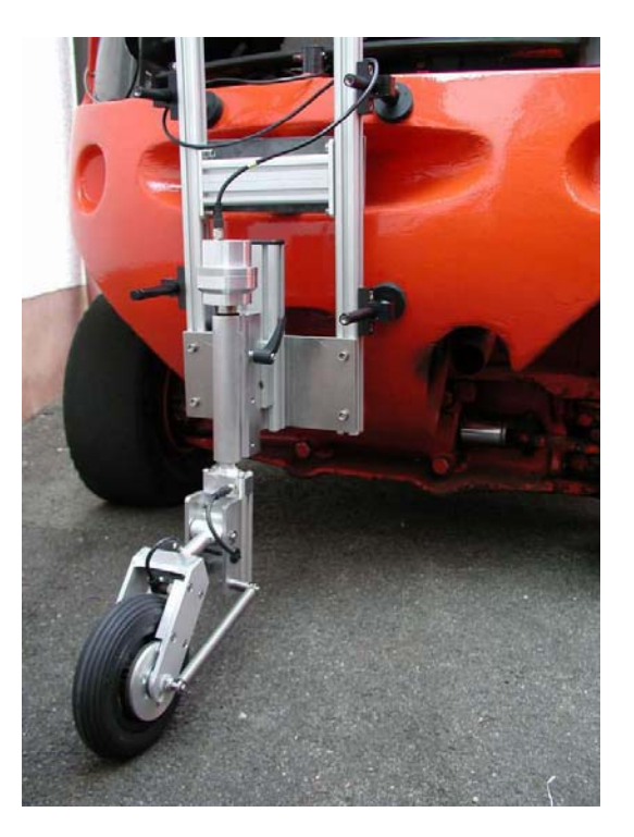
5W-6 Miniwheel with H-adapter and magnetic holders at the rear of a forklift truck