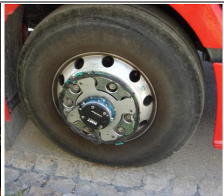
Application pictures of CT8-Wheel