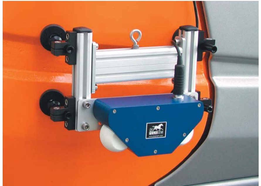
GSS20 with magnetic holders

The newly designed PEGASEM Radar Sensors allow carefree non-contact speed sensing over ground at a very competitive price. The road surface is