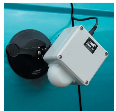
GSS10 with suction cup holders

wave antennas create a Doppler signal with excellent noise margin allowing measurements even in the ultra low speed range. The clean, high quality speed output signal outperforms many competitive non-contact vehicle speed sensors. Both models come in wea-