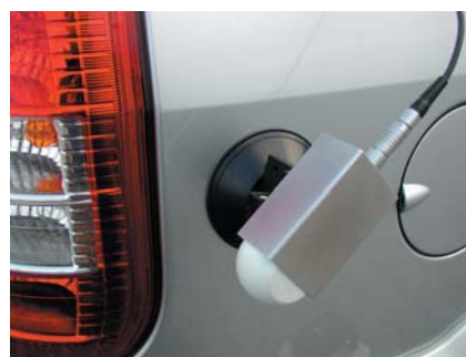
GSS11 with suction cup holder

scanned with a 24 GHz radar beam. The internal processor creates a high precision TTL- output signal with 100 pulses per metre from the raw Doppler