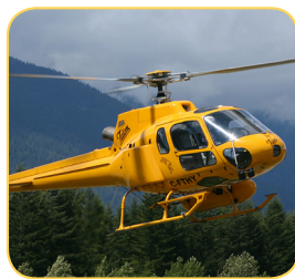
Flight Test Instrumentation

This standalone AHRS solution is designed for avionics retrofit and OEM aircraft applications. The AHRS500GA is available in several different configurations that provide the flexibility to accommodate various system interfaces, and typical mounting orientation and installation location requirements.