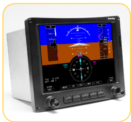
Primary Flight Display Systems