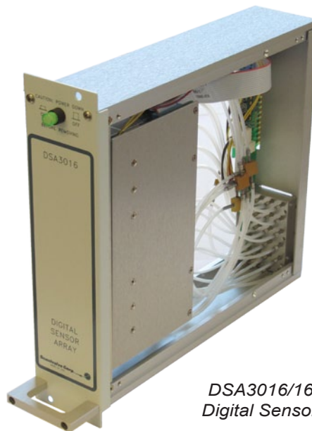
DSA3016/16Px-RA Digital Sensor Array

The DSP processor also controls the actuation of an