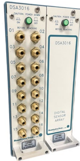
DSA3016 Front Access