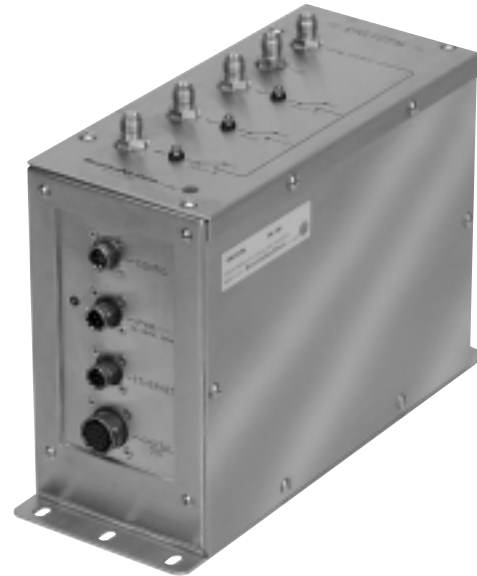
ENETCPM Control Pressure Module