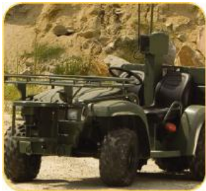
Navigation and Control