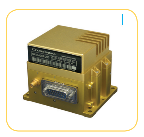
440-Series Inertial Systems

The NAV-DAC440 analog interface adapter is an invaluable accessory for customers wishing to use ACEINNA's 440-Series Inertial products in analogonly applications. The NAV-DAC440 converts the RS-232 serial digital outputs from 440-Series products to analog DC voltages.