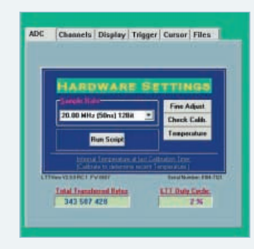
Setting the sampling rate

LTTview is simple to use and yet powerful software, which contains many functions to configure LTT-18x and to analyse the incoming data. The graphical user interface simplifies the use of the LTT systems. Integrated in the software, LTTview, are various export filters which save the data to common formats.