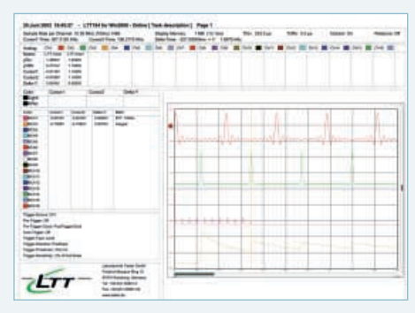
Data observation, analysis and saving