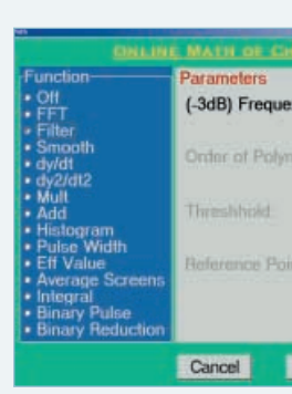
Activating the channels Choosing the mathematical