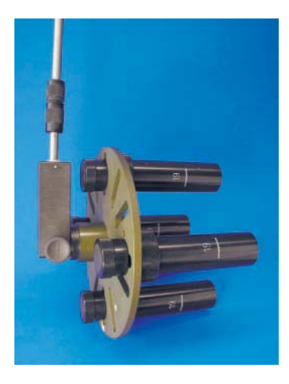
Wheel Speed Sensor Assembly with long Sleeves

Disks of up to 200 mm diameter are available from stock. Larger sizes can be produced quickly on request.