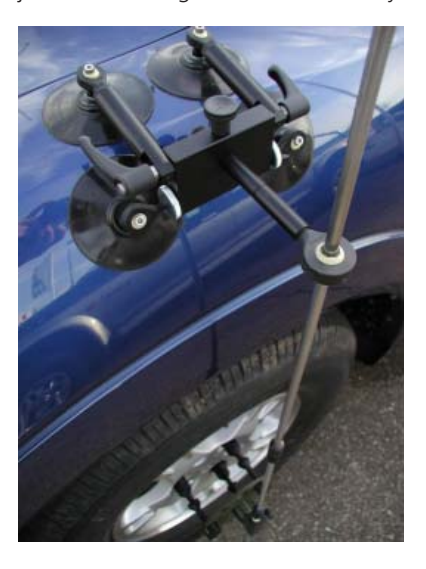
Holding Plate with 4 Suction Cups and lengthened Slip Joint

For front wheel mounting, where the steering angle can interfere with the Harness Protection Sleeve, the slip joint can be lengthened as necessary.