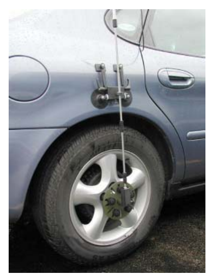
Holding Plate with Suction Cups and Magnets

The 100mm Sucction Cup with handle is a cost effective solution and suitable for flat surfaces. They can be mounted above the rear wheel at passenger cars or at trucks.