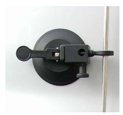
Suction Cup Holder above Rear Wheel

The 4<sup>th</sup> component is the Modular Holder for the fender. This holder provides the upper support of the system. It consists of a 100mm suction cup holder or a double arm plate each equipped with 4 suction cups, 4 rubber coated magnets or both.