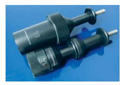
Clamp and Magnetic Holder lenghtened by 45mm

For bolts placed deeply inside the rim, the holders can be lengthened with extension pieces in steps of 45 mm. For the clamps, longer sleeves are available.