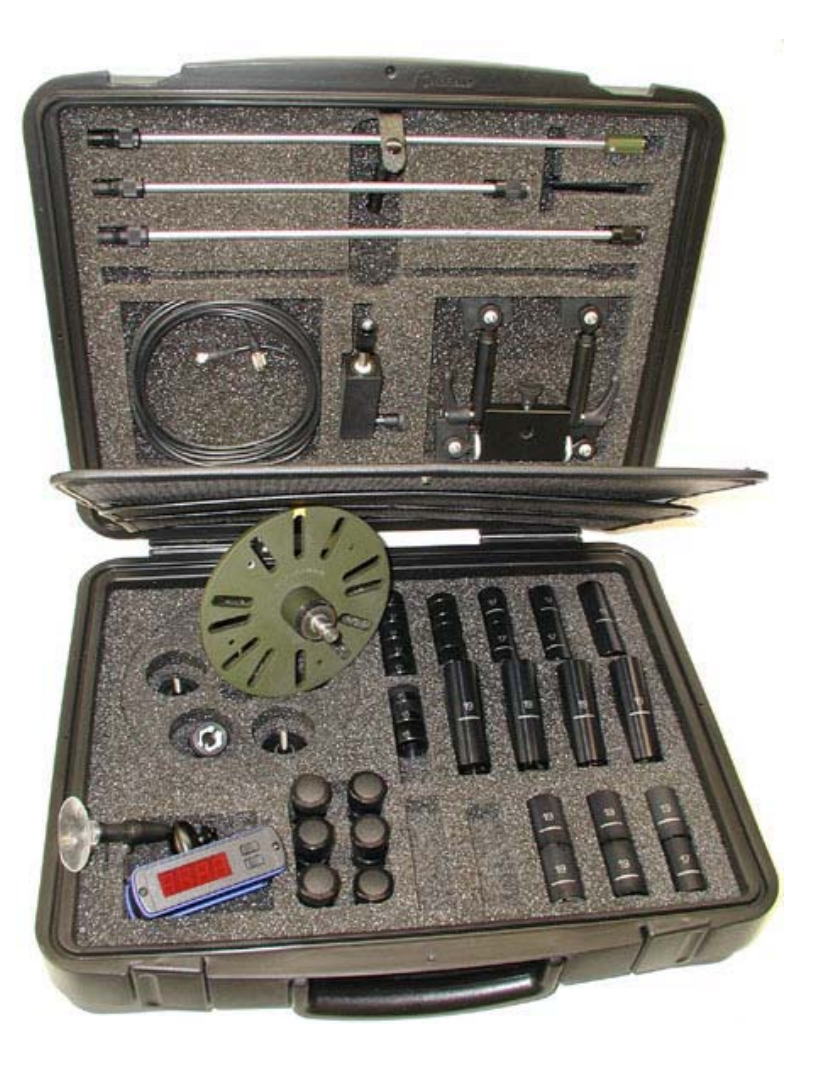
Carrying Case (Size 534 x 427 x 157 mm) for convenient transportation

This modular construction allows for ease of maintenance. The user with standard tools can easily replace any damaged part.