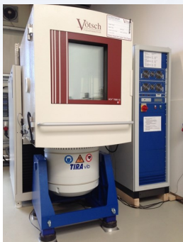
Vibration testing system with climate chamber