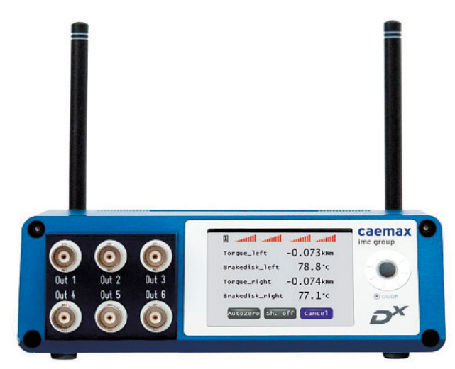
Dx-Receiver Unit (RCI)

With four Dx-Speed sensors, the telemetry receiver unit (Dx-RCI) synchronously acquires the measured values from all four wheels. The data appear in real time and can be collected and processed via CAN or analog.