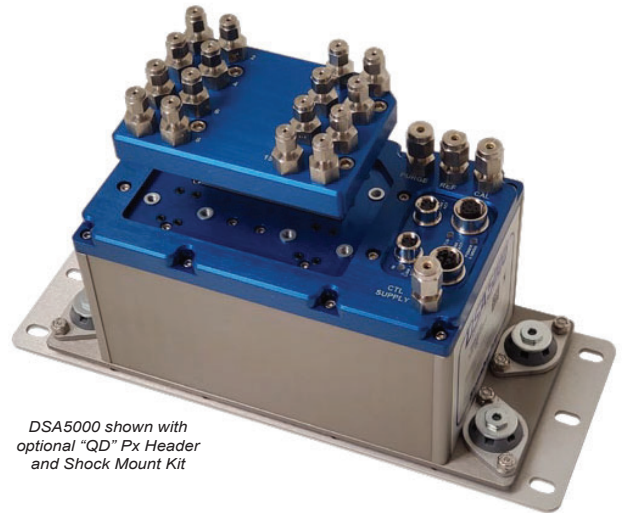
DSA5000 shown with optional “QD” Px Header and Shock Mount Kit

Standard DSA5000 modules come with the reference side of all 16 transducers manifolded to a single reference port. If the DSA is ordered as a dual-range unit, a reference port is provide for each range. As an option, the DSA can be configured with individual reference ports for all 16 channels. When true differential measurements are required, an 8 channel “True Differential” configuration provides inputs and calibration valves on both sides of each individual transducer. Absolute configurations are also available.