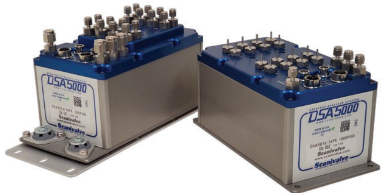
DSA5000 - Standard (right) DSA5000 - "QD" w/shock (left)

The result of the DSA5000's careful design is a complete package that makes multi-point pressure acquisition tasks simple and powerful.